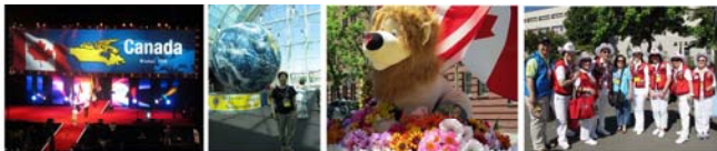
Lions International Convention in Seattle from July 4-8, 2011 attended by Grace & Moon